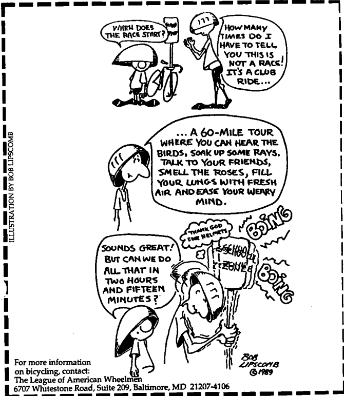
ILLUSTRATION BY BOB LIPSCOMB

We hope to see all of you soon at some upcoming events!!!!